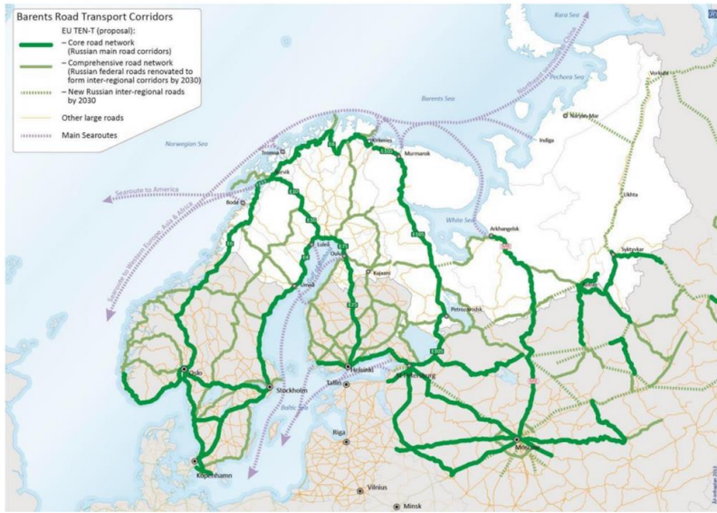
Figure 5. Prioritized road network by the EU and the Russian Federation