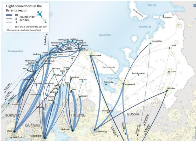
Figure 26. Air transport network