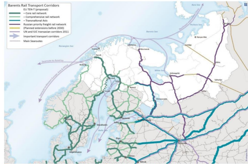
Figure 6. Prioritized rail network by the EU and the Russian Federation